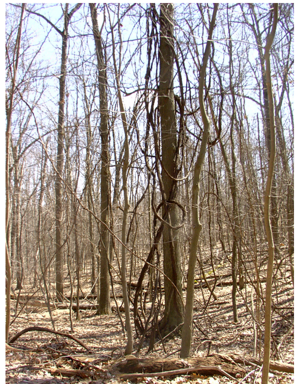
of Dryer Road Park showing the destruction caused by wild grape vines.